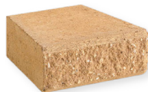
Cottage Stone Cap Size: 3" H x 8" W x 9" D Weight: 18 lbs